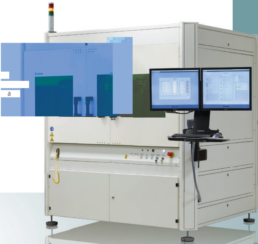
Mac , TL2000